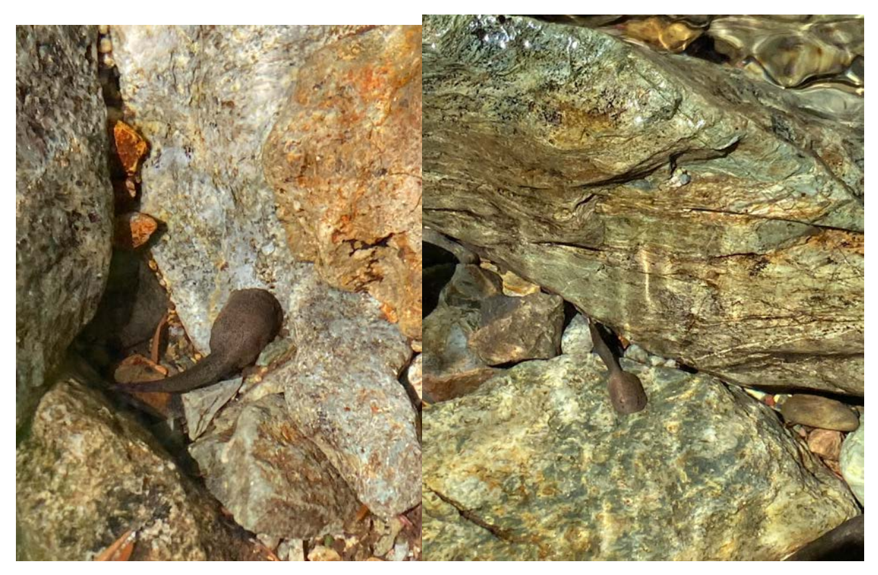
Figure 3: First CTF tadpole sightings in Mannon Creek.