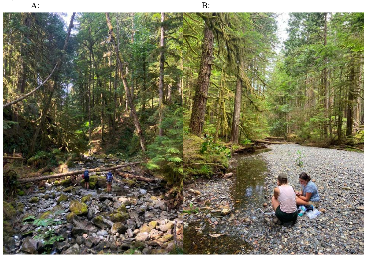
Figure 5: Sam and Sylvia hiking up Gambier Creek with our camping and sampling gear (A). Sample site along Gambier Creek (B).

one sample downstream from the Douglas Bay Pools along Gambier Creek, and three more above, totaling four samples. This creek dried up completely before it reached Gambier Lake. We then camped a second night at the Gambier Lake campground and hiked back across to West Bay the next day. This is where Sylvia took the additional samples from McDonald Creek, as the trail crosses into the head of West Bay.