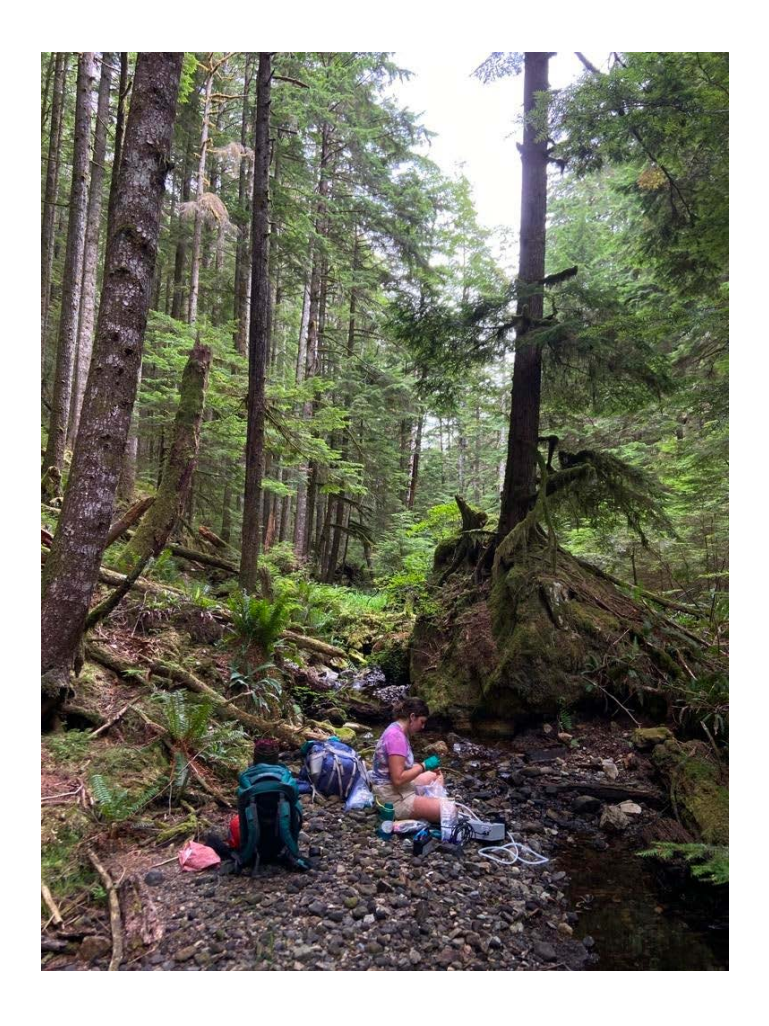
Figure 1: Sylvia on our second McDonald Creek sampling day.