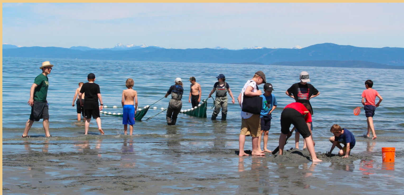
(Mount Arrowsmith Biosphere Region, 2022)