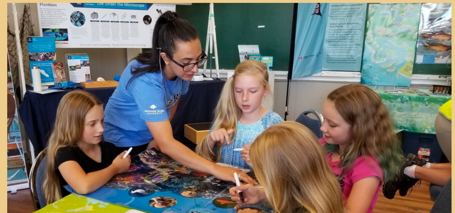
(Mount Arrowsmith Biosphere Region, 2022)