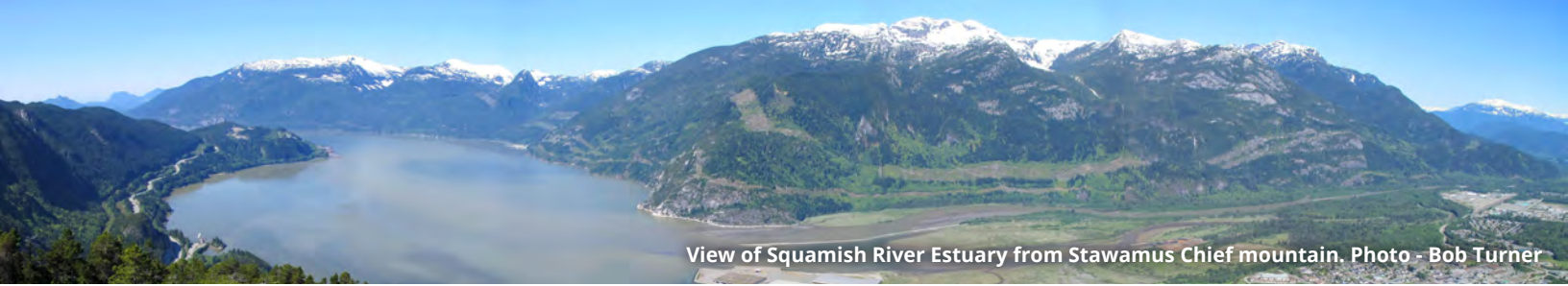
View of Squamish River Estuary from Stawamus Chief mountain.