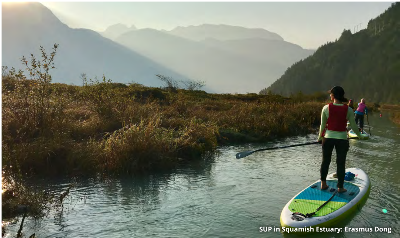
SUP in Squamish Estuary: Erasmus Dong

Please visit howesoundbri.org/unityplan to answer our discussion paper questionnaire.