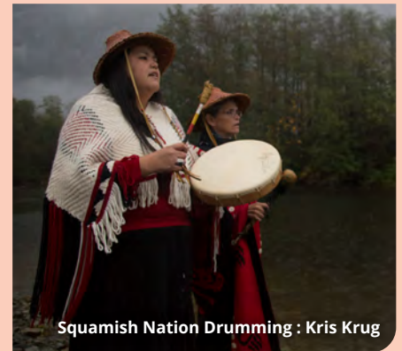
Squamish Nation Drumming : Kris Krug

We are committed to engaging with Indigenous Peoples, all levels of authorities, the public, environmental NGOs, opinion leaders and industrial users, all of whom have varied and unique contributions to make on the path to the Nchu' 7mut/Unity Plan.