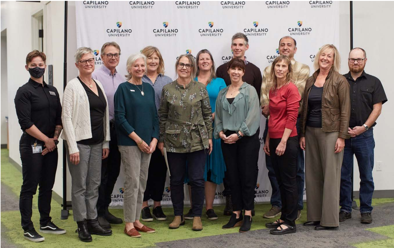
Cap U/Howe Sound Biosphere Working Group team meets quarterly to review opportunities and plans.

We are thrilled with Capilano University's purchase of Quest University in Squamish and the opening of the academic year. Our partnership with Cap U aims to connect more youth to nature and bring capacity to our partners in the region. For the past three